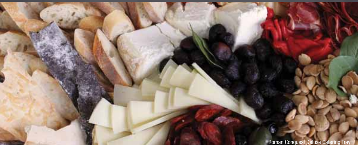
Roman Conquest Deluxe Catering Tray

P astoral has a variety of other products and services designed to help make your party, corporate gathering or family get-together a success. Stop in to any of our Chicago locations or visit pastoralartisan.com for more information on the following: