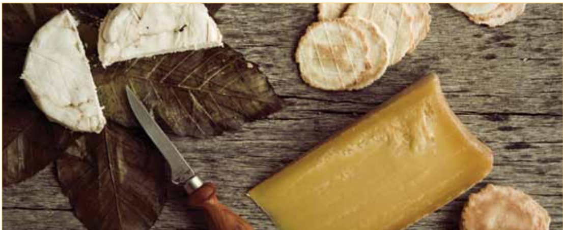
Pictured (left to right) O'Banon from Capriole, Greenville, IN, Goat's Milk, Tarentaise from Spring Brook Farm, Reading, VT, Raw Cow's Milk

Please see pastoralartisan.com for complete shipping policies.